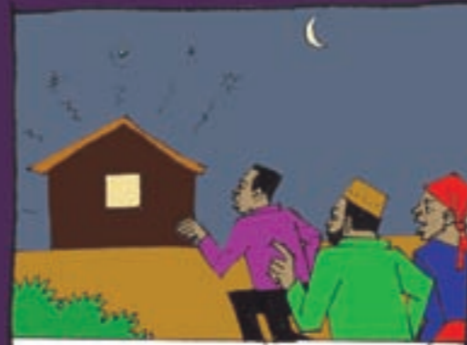
We stopped ignoring the violence in our neighborhood.