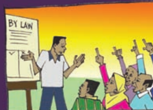
We trained our officers on how to deal with violence.