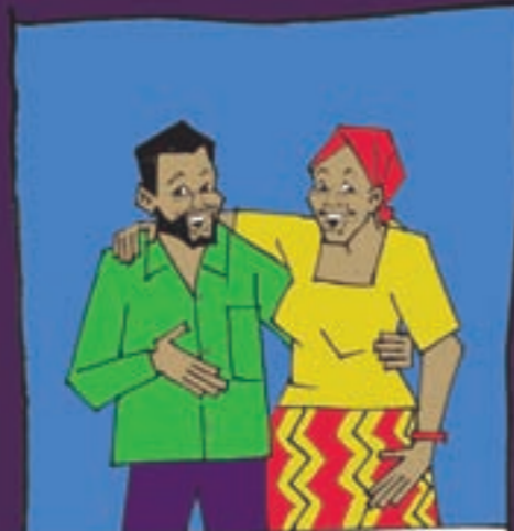
We committed to never using violence in our relationship.