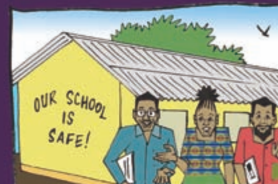
We made a no tolerance policy for sexual harassment and abuse.