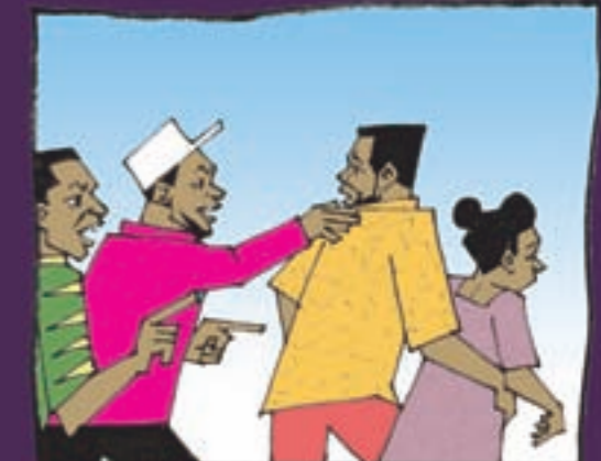
We confront men who we see with girls and young women.