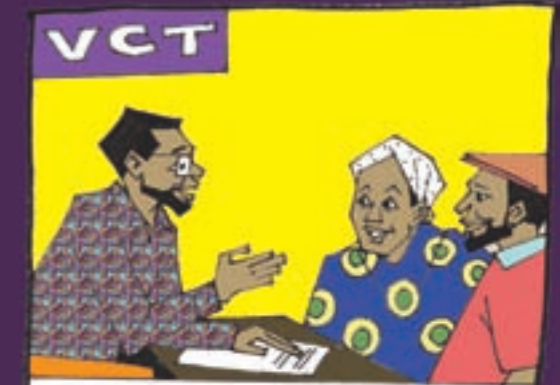
We trained our counselors to address violence.