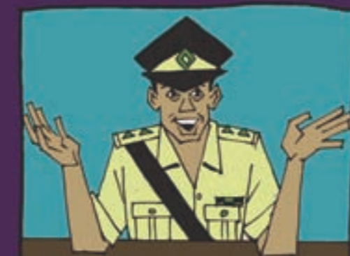
We created a bylaw against domestic violence.