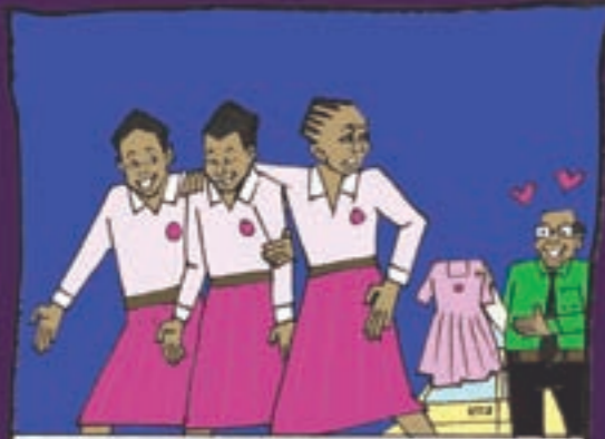
We watch out for each other.