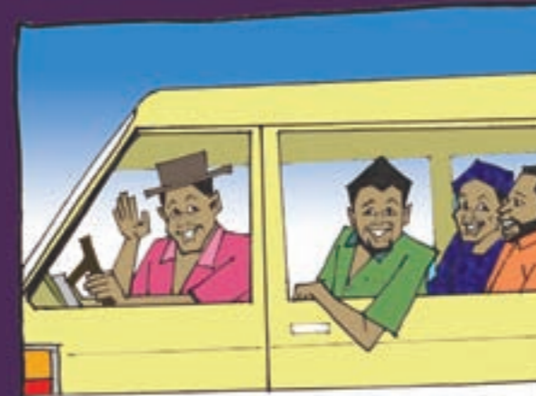
We stopped moving around with other women.