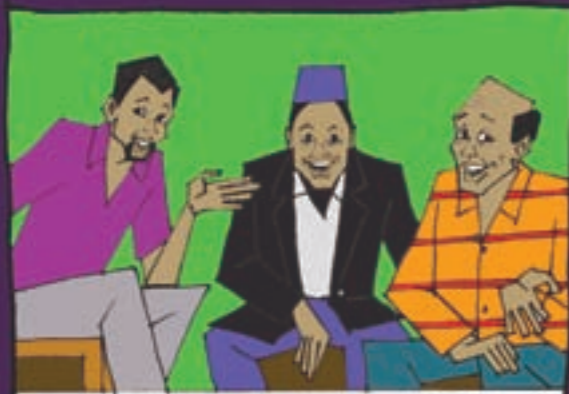
We started talking about violence and HIV/AIDS.