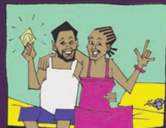
We use condoms every time.