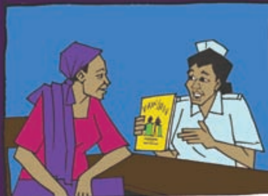
We talk to clients about violence and HIV & AIDS.