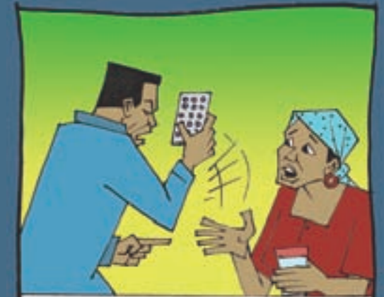
Denied access to treatment and care