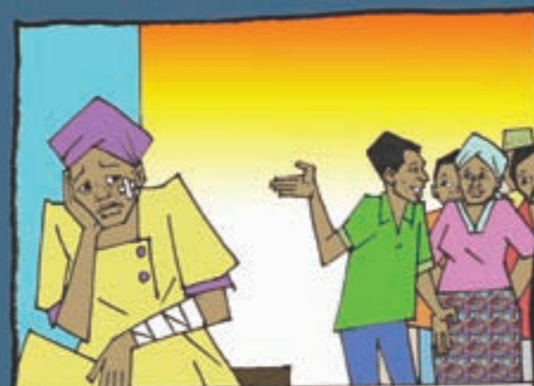
Isolation and stigma