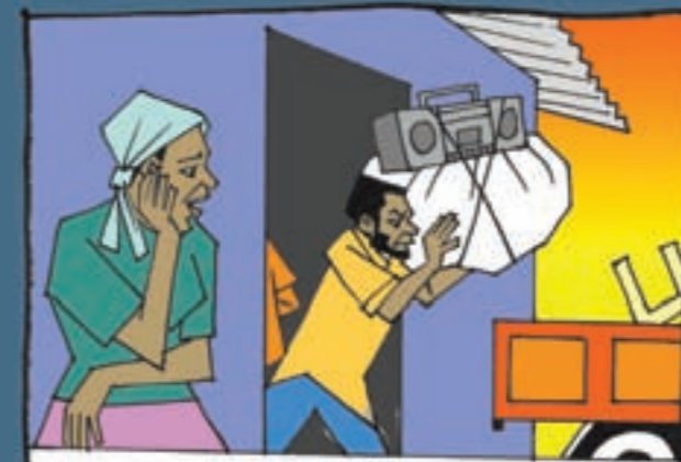
Loss of inheritance