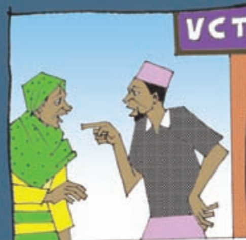
Prevented from testing for HIV